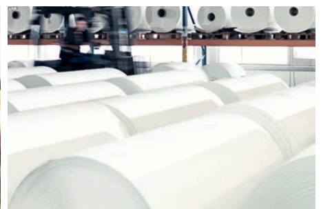
PACKAGING & INDUSTRIAL