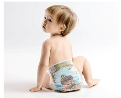
HYGIENE & INDUSTRIAL